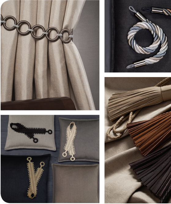
Clockwise from top left, Samuel & Sons Passementerie, Zimmer + Rohde, Samuel & Sons Passementerie, Zimmer + Rohde.

Visit the trimmings department of your local showroom for softer solutions that pair beautifully with our hardware holdbacks and tiebacks.