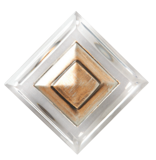
Clear Resin Rosette The Finial Company