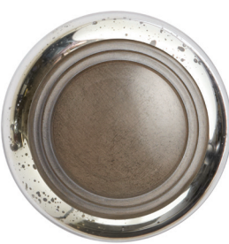
Blake - Mercury Glass Paris Texas Hardware