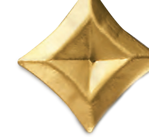
Tieback in Black/Gold JAB Decorative Hardware Vol. III